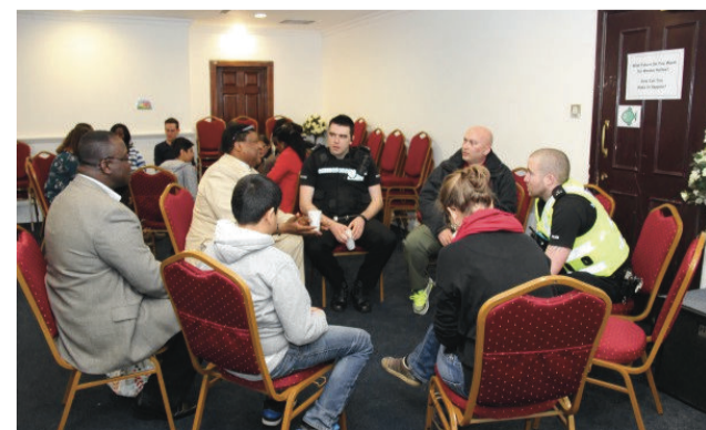
Community discussion in action

WHCT will help to put local people at the heart of decision making and delivering action to improve outcomes for Wester Hailes.