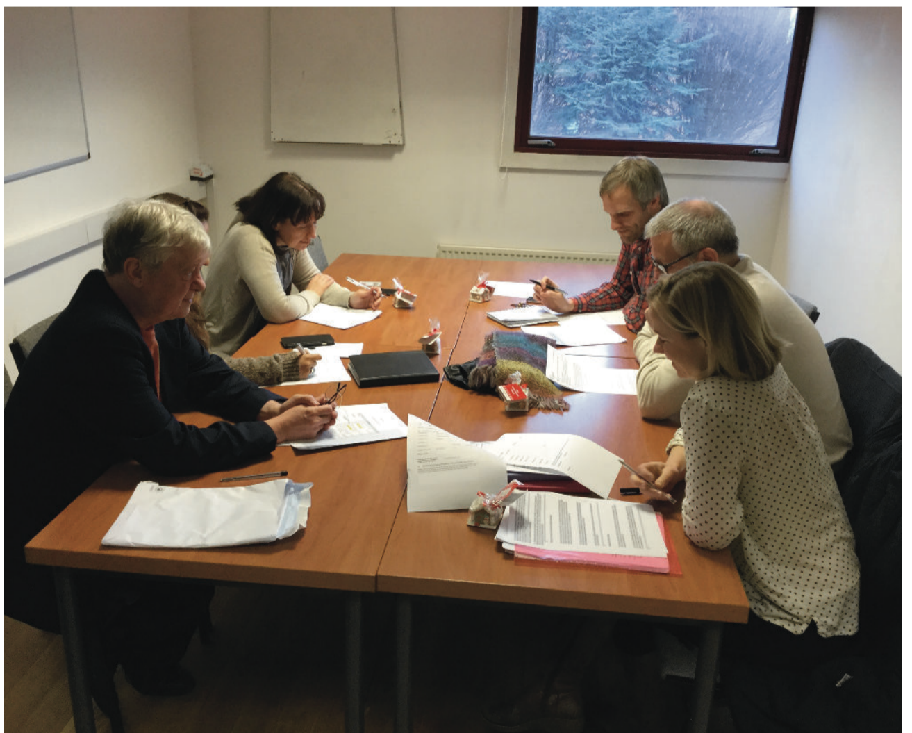
The team hard at work finalising the Trust's constitution

Venue: Wester Hailes library (upstairs in the Connect Room)