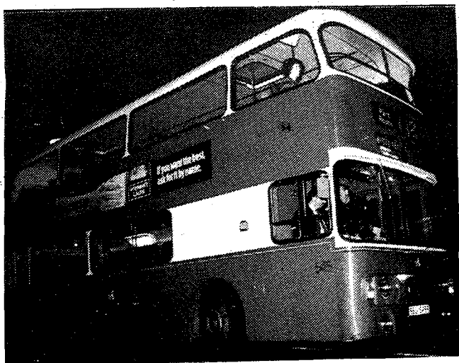
No more taxis! A welcome sight for nightriders.

Community Services, 442 1097; Dental Clinic, 442 3768, and G.P.'s 443 2291.