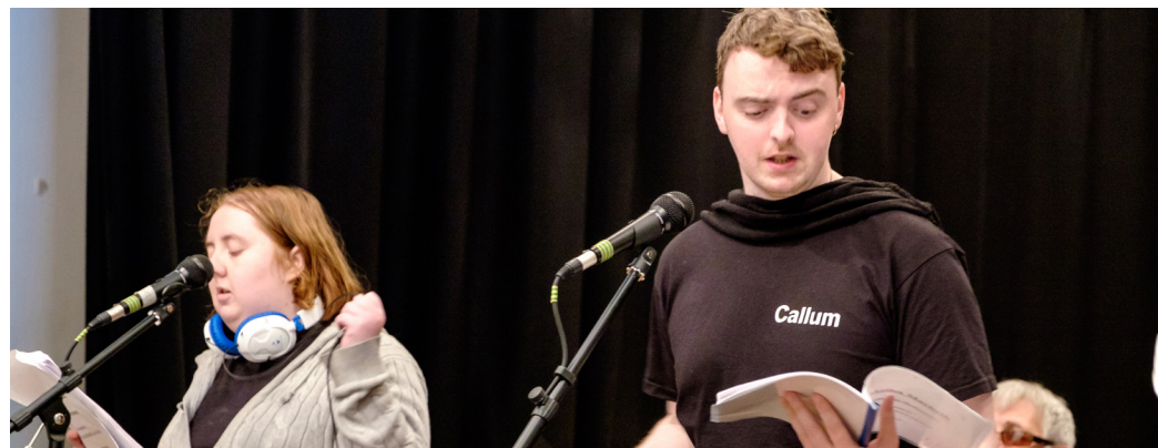
WHALE's Without a Cause performance at WHALE 25th Birthday.

Free IT drop-in sessions alternating between WHALE Arts Centre and Clovenstone Community Centre, starting at WHALE on 11 Jan. Learn basic IT skills and support your local news website, www.digitalsentinel.net .