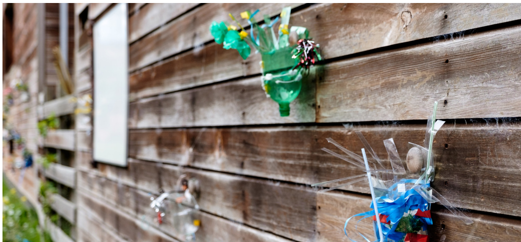
Eco-planter in Westburn CAN garden at WHALE Arts.

The Arty Party was established as a registered charity in 1997 to promote and raise appreciation of all art forms for the benefit of the adult population of Wester Hailes and the surrounding districts, in particular for older people and those who are traditionally excluded from the arts through the barriers of income or physical inaccessibility.