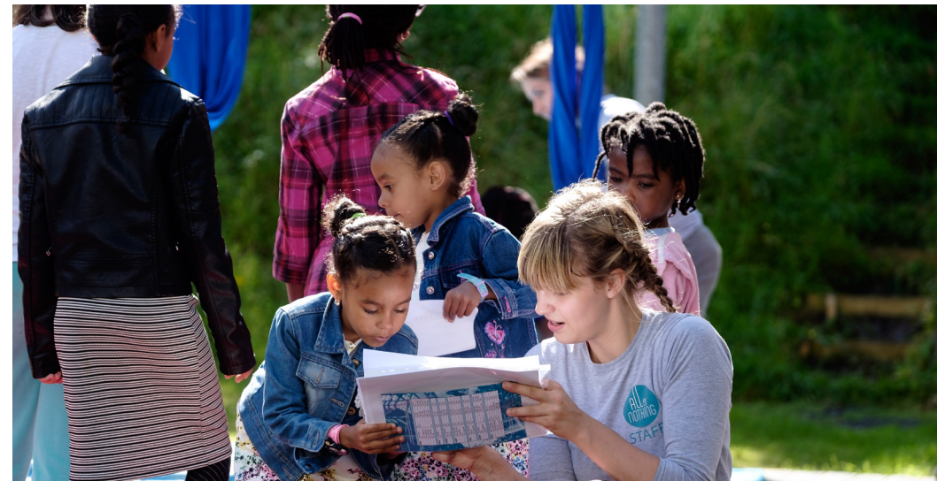
WHALE Arts 25th Birthday Party.

Relaxed and fun ceilidh dancing with expert tuition for all adults.