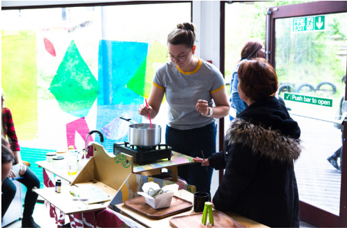
Tasting Change with Fork in the Road.