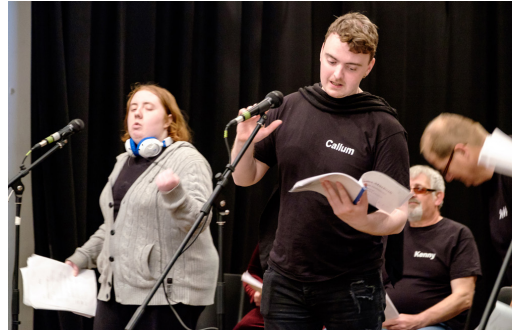
WHALES without a Cause.

Stitch 'n' Time – Our award winning textile group saw 23 participants work on a range of community projects including costumes for the local drama group and Christmas stockings for Heathervale Young People's Centre. A motion was raised in The Scottish Parliament in recognition of the group's map of Wester Hailes, now on display at Clovenstone Community Centre.