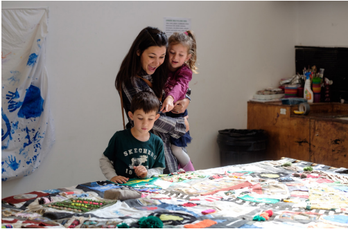
WHALE's 25th Birthday.