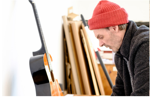
smART Craft.