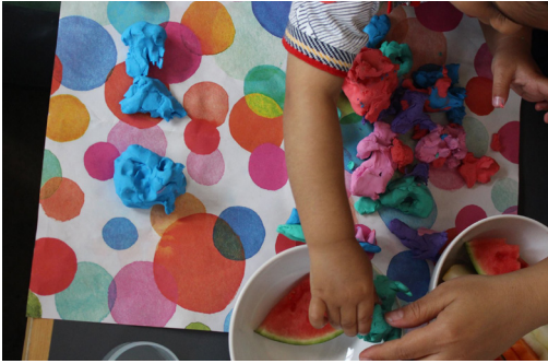
Expecting Something.