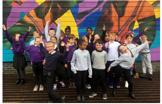
Clovenstone Primary School at WHALE.

creating artwork and sculpture for the WHALE garden in partnership with Westburn CAN.