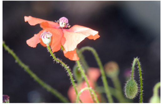
WHALE Community Garden.