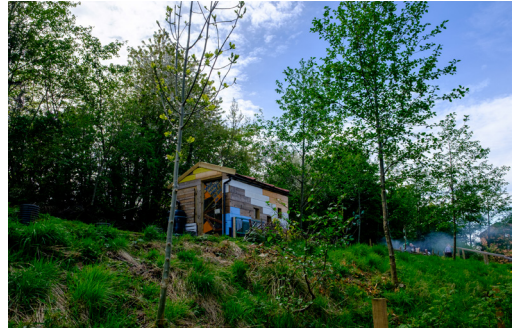
WHALE Community Garden.