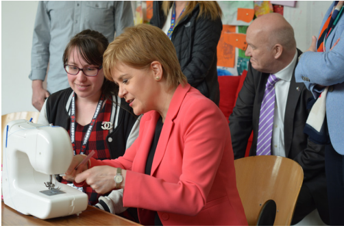
Stitch 'n'Time participants with First Minister, Nicola Sturgeon.