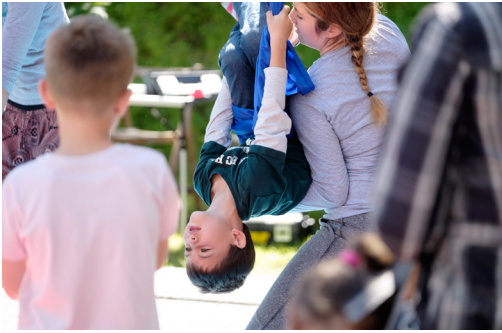
WHALE 25th Birthday Celebrations.