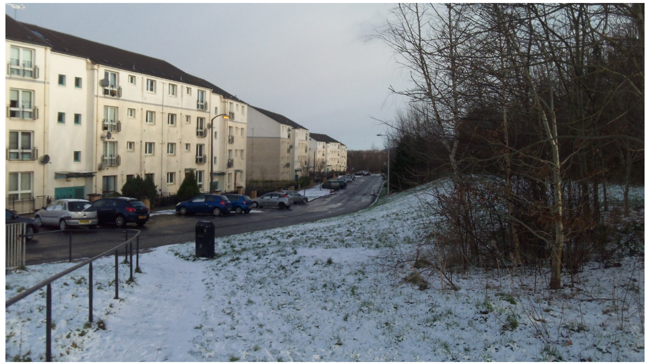
A breakdown of the great activities across Wester Hailes everyday - Page 2 and 3 Our poster with some of the emergency support available over the Holiday period - Page 4

Patients will be contacted by text message with an invitation to any planned events – please make sure your mobile phone number and details with the practice are up to date. But they will also be advertising in the community so keep an eye out for any news!